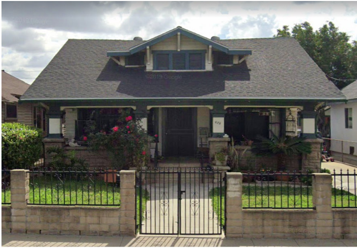
a. Historical Significance, style 629 S Evergreen Ave Brenda's neighbor across the street